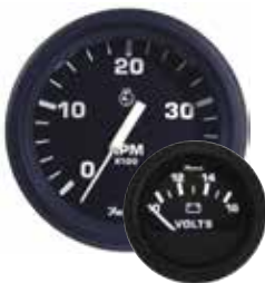
Heavy Duty - Black