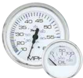
Chesapeake White SS