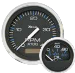
Chesapeake Black SS