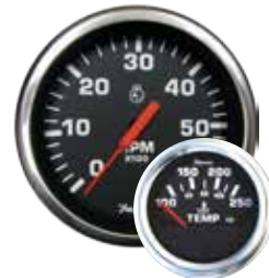
Heavy Duty - Silver