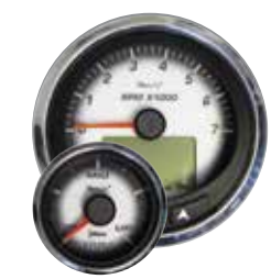
Digital Black Fade