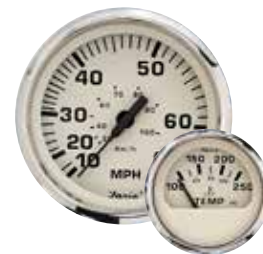
Euro Beige SS