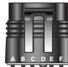
6- pin connector(CN0083)