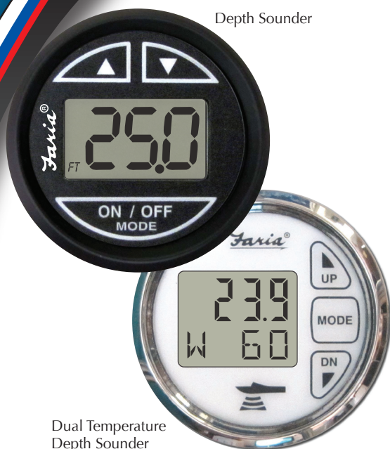
Dual Temperature Depth Sounder