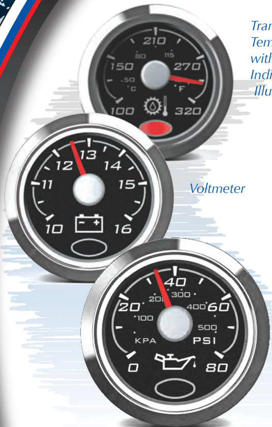
Transmission Temperature with Warning Indicator Illuminated