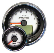
Digital Black Fade