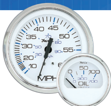
Chesapeake White SS