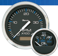
Chesapeake Black SS