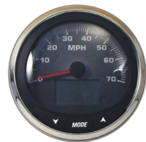
Digital Gray Fade